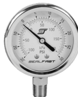
LM Lower mount